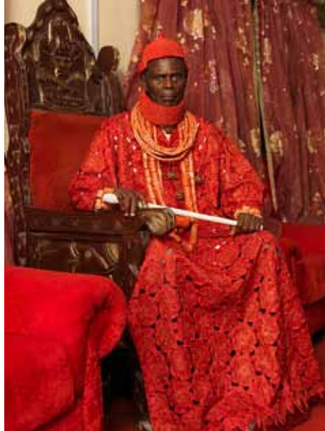
Royals and Regalia Exhibit at Newark Museum: HRM Pere Donokoromo II, The Pere of Isaba Kingdom

1 Normal Avenue, Montclair 973.655.7071 https://blogs.montclair.edu/oeco/events/