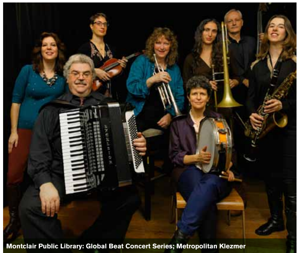
Montclair Public Library: Global Beat Concert Series; Metropolitan Klezmer

December 18: Solid Gold Christmas starring Marilyn McCoo and Billy Davis, Jr. Combining hits from their 40 years in the entertainment industry with harmonized Christmas classics, this