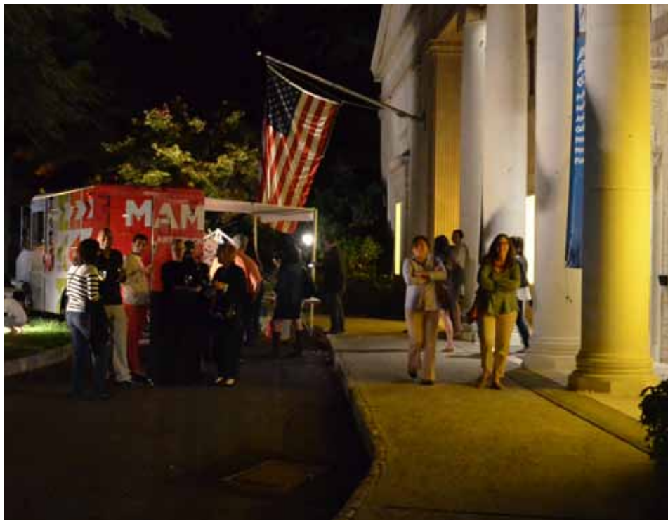
"First Free Thursday Nights" at Montclair Art Museum