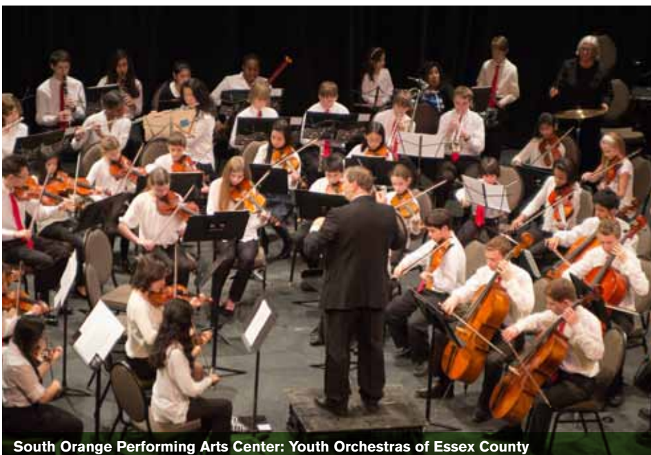
South Orange Performing Arts Center: Youth Orchestras of Essex County

January 23, 24, 30 & 31: Opera Theatre of Montclair presents NABUCCO by Giuseppe Verdi. Opera Theatre of Montclair presents Verdi's NABUCCO, a biblical epic, staged and costumed, with singers and a 36-piece orchestra directed by Italian conductor Daniele Tirilli. Unitarian Universalist Congregation at Montclair, 67 Church Street, Montclair. 7:30pm. $50 standard, $40 seniors & students, $30 groups of 10 or more. 973.202.7849. www.operamontclair.org