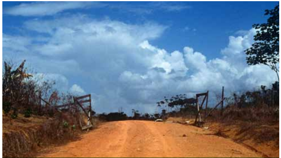
Montclair Art Museum: Doug Aitken (born 1968, USA). Monsoon, 1995. Color film, sound, transferred to digital video. 6 min. 43 sec. loop. Courtesy of 303 Gallery, New York; Victoria Miro Gallery, London; Galerie Eva Presenhuber, Zurich; Regen Projects, Los Angeles © Doug Aitken

February 27: MAM Annual High School Lecture. High-school students are invited to attend an engaging morning in conversation with Pepón Osorio, a featured artist in “Come as You Are: Art of the 1990s.” Montclair