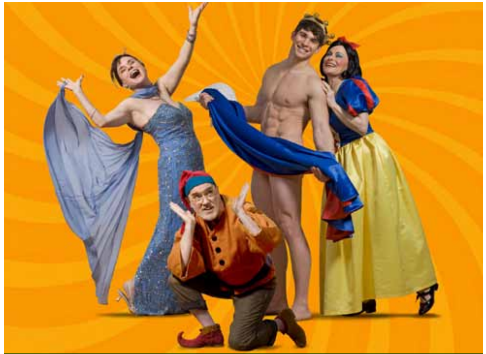
Paper Mill Playhouse: Vanya and Sonia and Masha and Spike

December 26: Matisyahu, Festival of Light. Matisyahu, a Grammy Award-nominated reggae/rap/alternative rock performer, plays highlights from his five hit albums: Live at Stubbs , Youth , Light , Spark Seeker and Akeda . South Orange Performing Arts Center, 1 SOPAC Way, South Orange. 8pm. $38, $43, $48. 973.313.ARTS. www.sopacnow.org