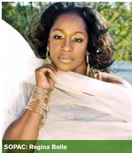
SOPAC: Regina Belle

Grammy Award and Academy Award-winning New Jersey native Regina Belle, known for her performance of the Disney duet "A Whole New World" from the 1992 animated feature "Aladdin", sings stellar offerings such as "Make It Like It Was," "If I Could," and "Dream In Color." South Orange Performing Arts Center, 1 SOPAC Way, South Orange. 8pm. $48, $58, $65. 973.313.ARTS. www.sopacnow.org