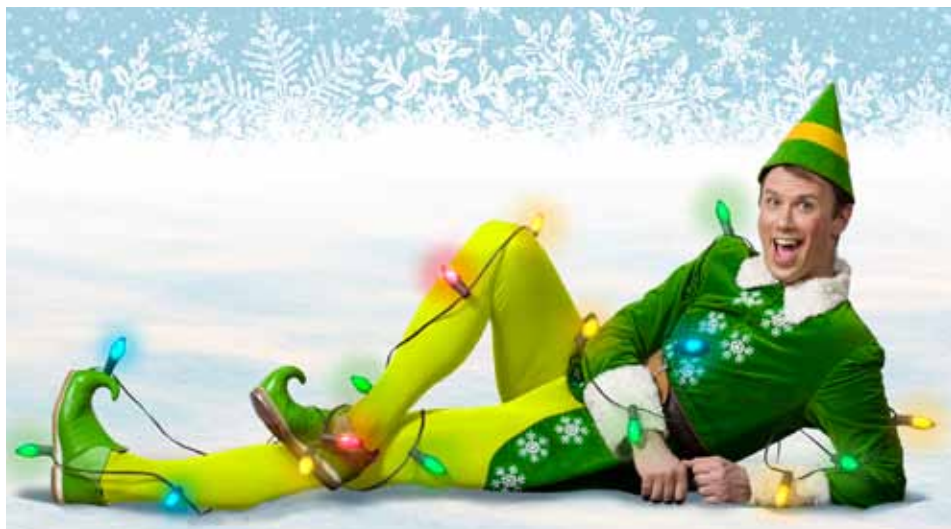
Elf at Paper Mill Playhouse