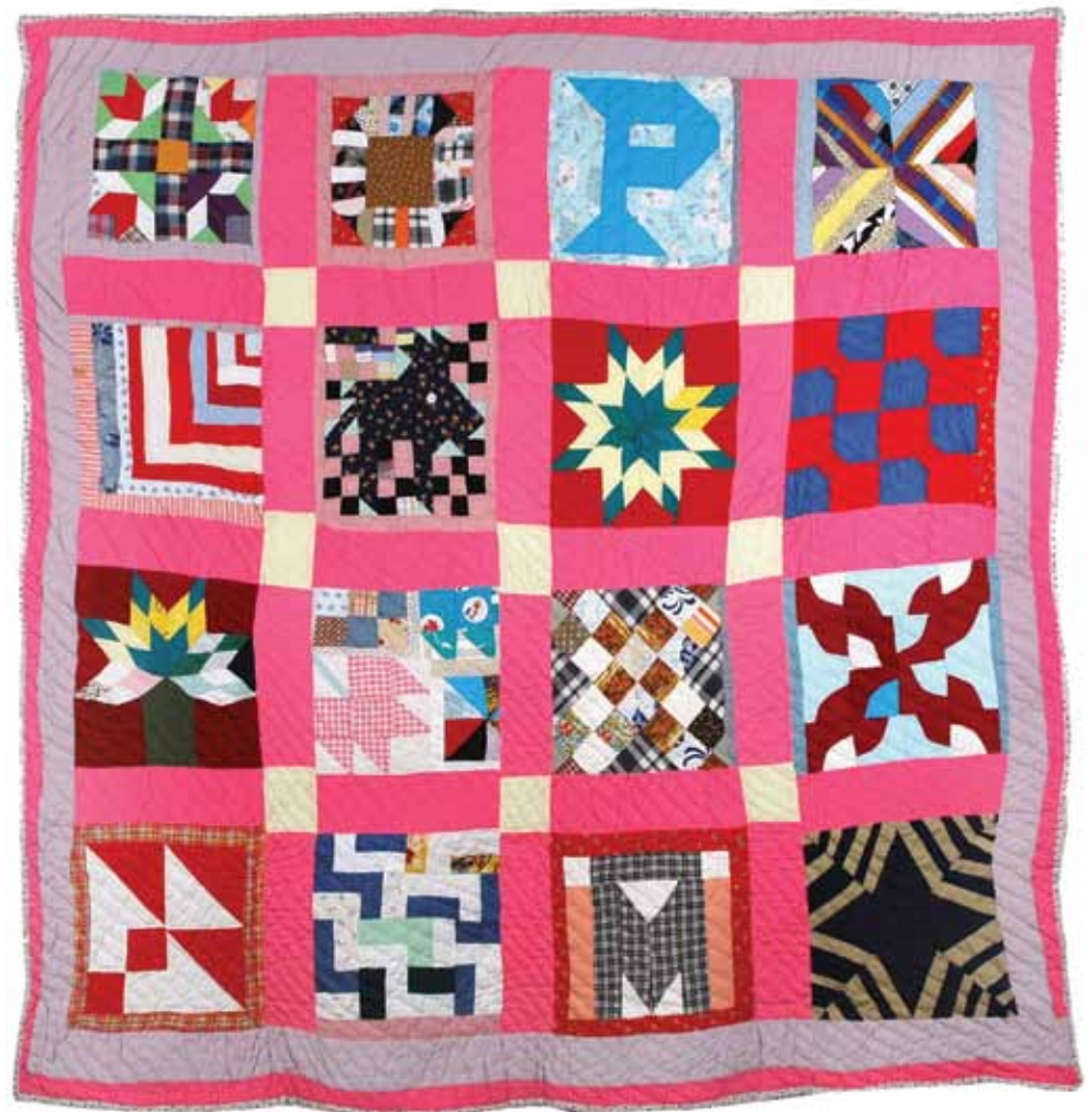
Montclair Art Museum: Mary Maxtion. Everybody Quilt, ca. 1991. Cotton, cotton/ polyester blend, polyester, wool, rayon. Montgomery Museum of Fine Arts, Montgomery, Alabama,

Members of the art faculty of the South Orange-Maplewood Public Schools present new work in a range of media and styles. In addition to being art educators, all are practicing artists who have shown in New York City and throughout the country. 10 Point Perspective includes paintings,