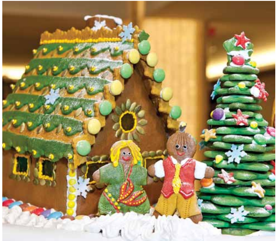
Gingerbread House Making Workshop at Essex County Environmental Center

Seasonal events sponsored by the Essex County Department of Parks, Recreation and Cultural Affairs