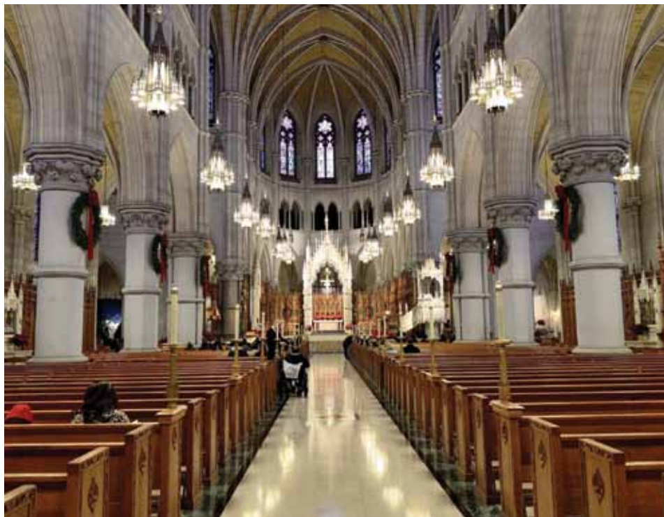
The Cathedral Basilica of The Sacred Heart: Concert Series

January 8: Portraits. At the club's monthly educational program, Jeff Wolfson will discuss photographing portraits using natural lighting.